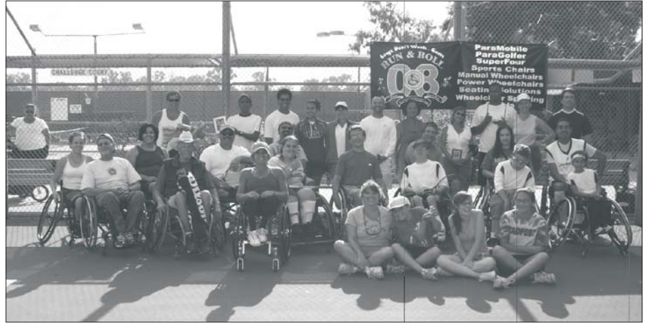
2007 Run and Roll participants.

The 2nd annual Run and Roll tournament was held at Balboa Tennis Club on July 19, 2008. Thirty six players participated (18 wheelchair players and 18 ambulatory players) in doubles matches against players of the same ability. The tournament included three divisions (beginner, intermediate, and advanced) and two pools in each division. Each team played three other teams in their pool and the team with the most points advanced to play the